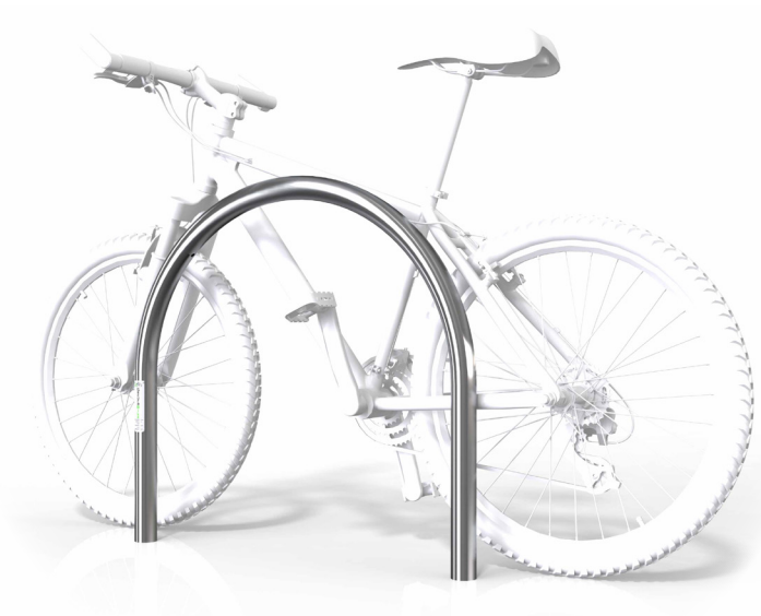
BR85F Galvanised SBR85F Stainless Steel