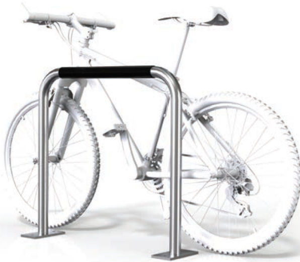
BR11B Galvanised SBR11B Stainless Steel