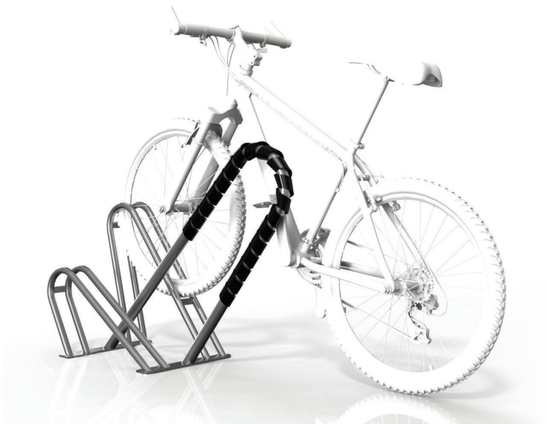
Front View 600