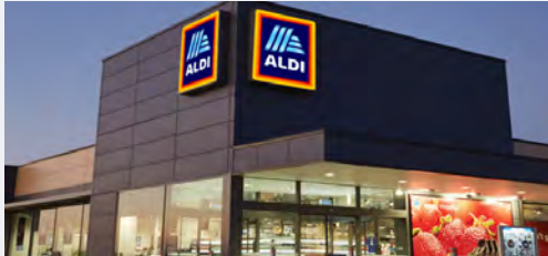
Aldi Location: South Australia & Queensland