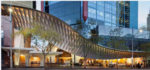
GPT Location: National