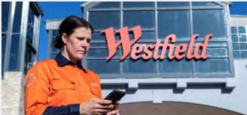
Scentre Group (Westfield) Location: National