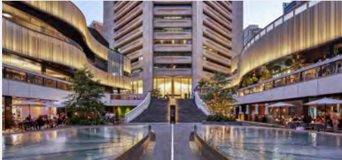
Dexus Location: VIC, NSW, WA