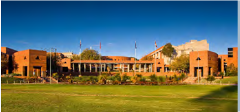
Curtin University Location: Western Australia