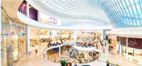
Vicinity Shopping Centres Location: National